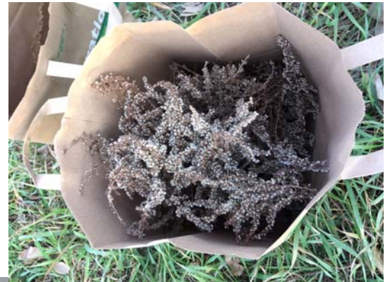
Seeds collected for the Bellemere restoration demonstration project

Thanks to everyone who attended the workshops and participated in the project in 2017. We can't wait to get started on the next series and hope you'll join us again!