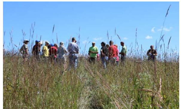
Prairie Appreciation Day at Snyder Prairie