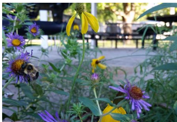
Planting day (left) and late summer (above) at the native plant garden in Brook Creek Park, Lawrence, at 12th & Brook St.