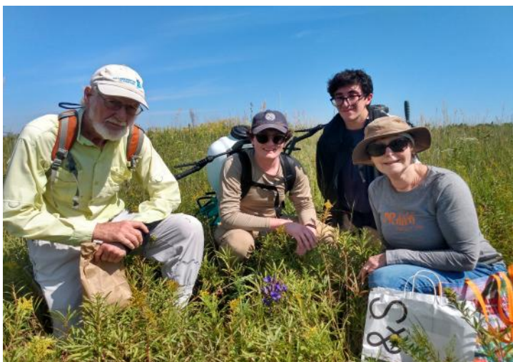
September Groundhogs at Snyder Prairie with Down Gentian, a fairly rare plant