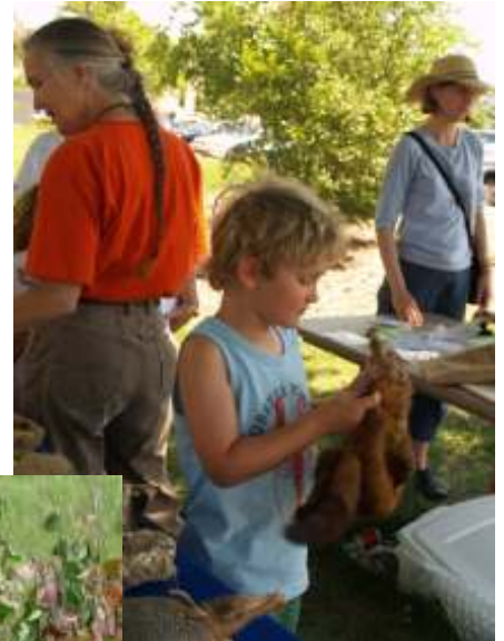
Rolling Prairie Learning Lab at the Lawrence Public Library