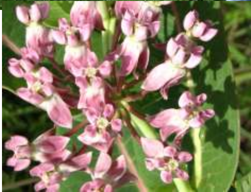
A patch of Sullivant milkweed being overtaken by dogwood was the focus of Groundhogs in July